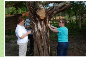
Tree surveying for Ancient Tree Hunt