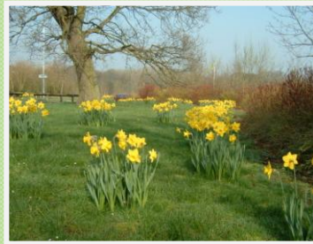
Daffodils planted at Westmorland Park